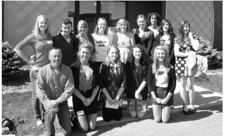
Above: Art students who participated in the Conference Art Show pose for a picture.

The art students will have their next showing at the Algona library. The showing will start on May 4 and will last a week. Also they will be showing their projects during the next vocal concert.